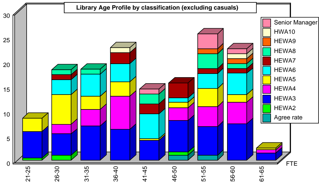
Fig. 2 Queensland University of Technology Library Age Profile

senior managers are over 50. As well, a large proportion of staff in supervisory roles are in this age bracket.